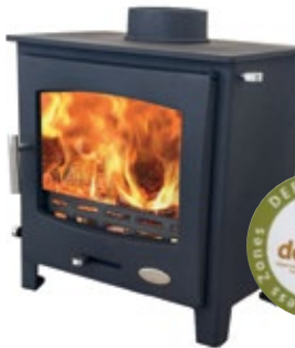
Woolly Mammoth 5 WideScreen