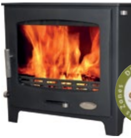
Woolly Mammoth 7