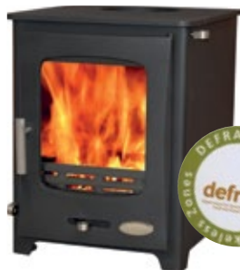
Woolly Mammoth 5